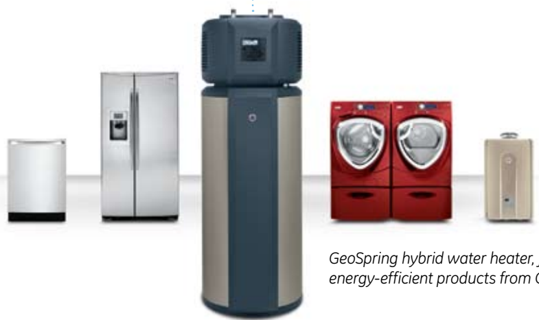
GeoSpring hybrid water heater, just one of many energy-efficient products from GE.